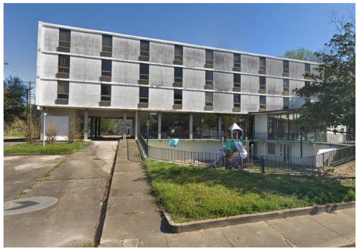
[Google Maps, Street View, 2019]

The subject property is a former hotel, constructed in 1958. Now owned by the City of Opelousas, the vacant property was last used as a women’s shelter, the New Life Center. An EPA contractor completed a Phase I Environmental Site Assessment in October 2019, documenting the likely presence of asbestos-containing material and lead based paint.