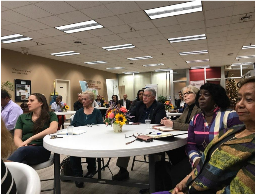
October 30, 2019 Photo 4: Thirty-six (36) community members attended the Community Reuse Visioning Session.